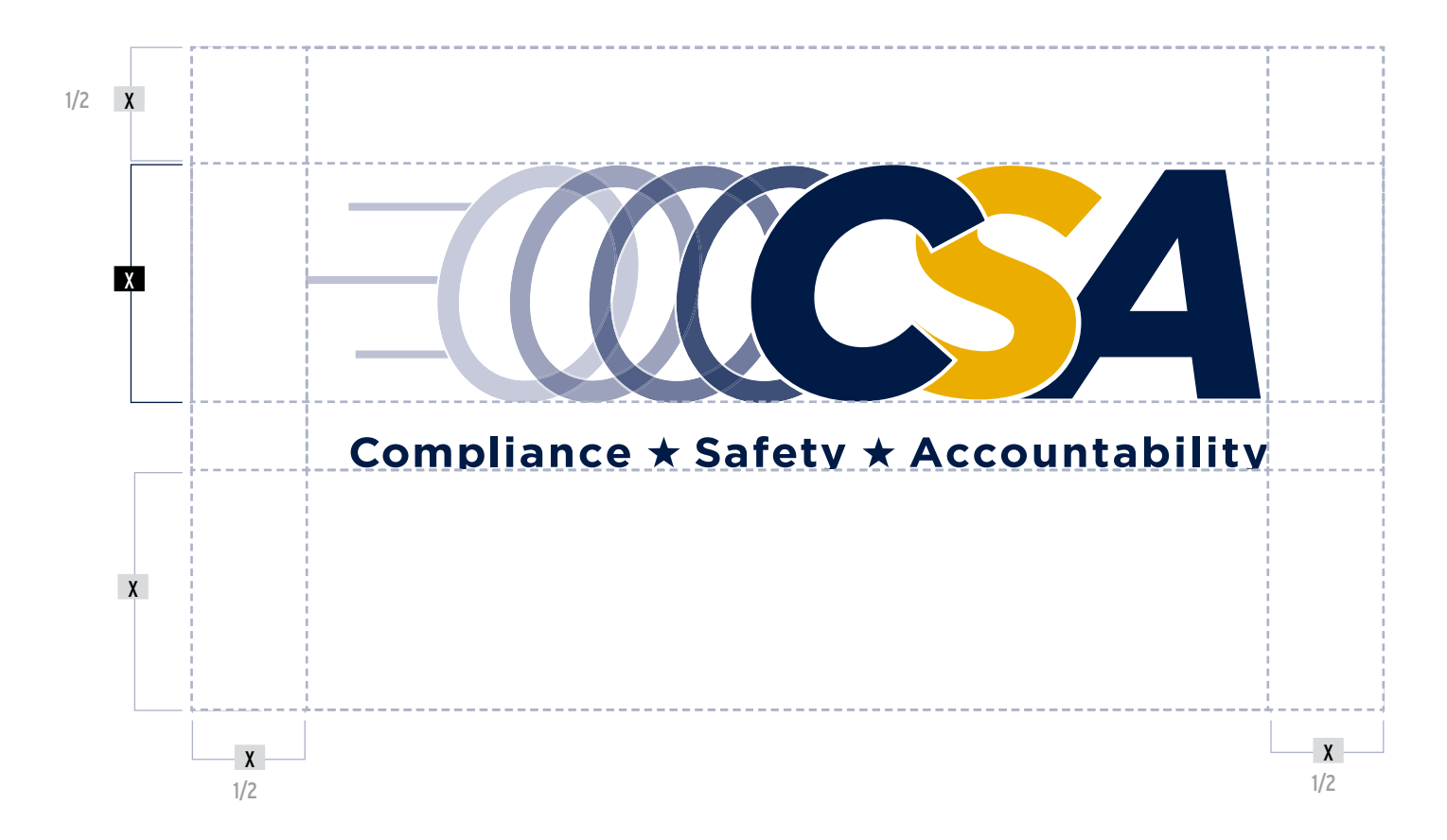
"x" height equal to the height of the letters "CSA"

Clear space rules have been established to make sure that other graphic elements do not interfere with the brand elements visually. The minimum required clear space is defined below by the established "X" measurement, based on the height of the letters "CSA" in the wordmark portion of the logo. As the logo is reduced, the clear space maintains a proportional relationship to the size of the logo.